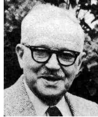
Jerzy Neyman (1894-1981)